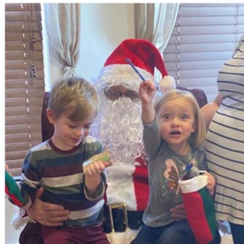
Santa upstaged by future Hallmark movie star