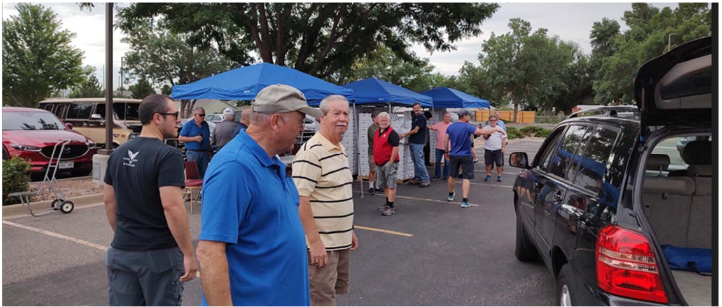
Lots of help and perfect weather for loading peaches into customers cars.

Cars pulled in and had orders loaded as their names were checked off.