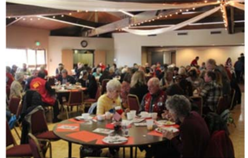
Veterans and Families