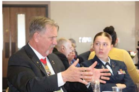
State Deputy with Grand Daughter