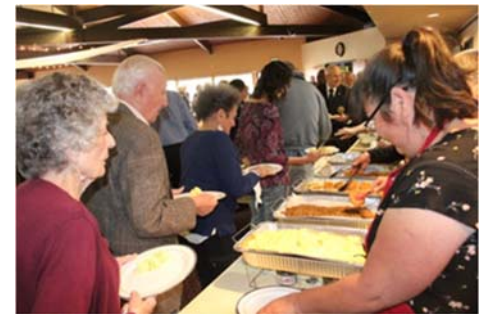
Breakfast serving line