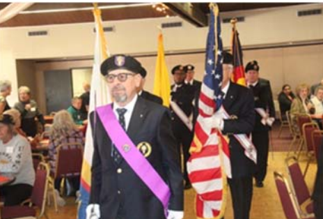
Assembly Posting Colors