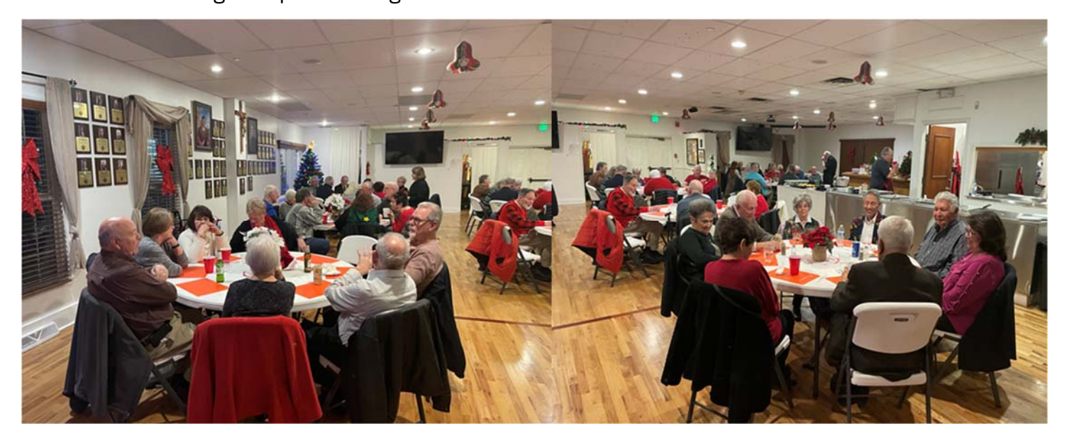
Enjoying the Gift Exchange!